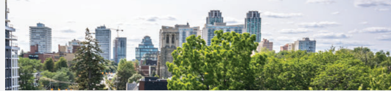
4th floor view facing west

2,633 sf Total – 2,381 sf Interior / 252 sf Exterior