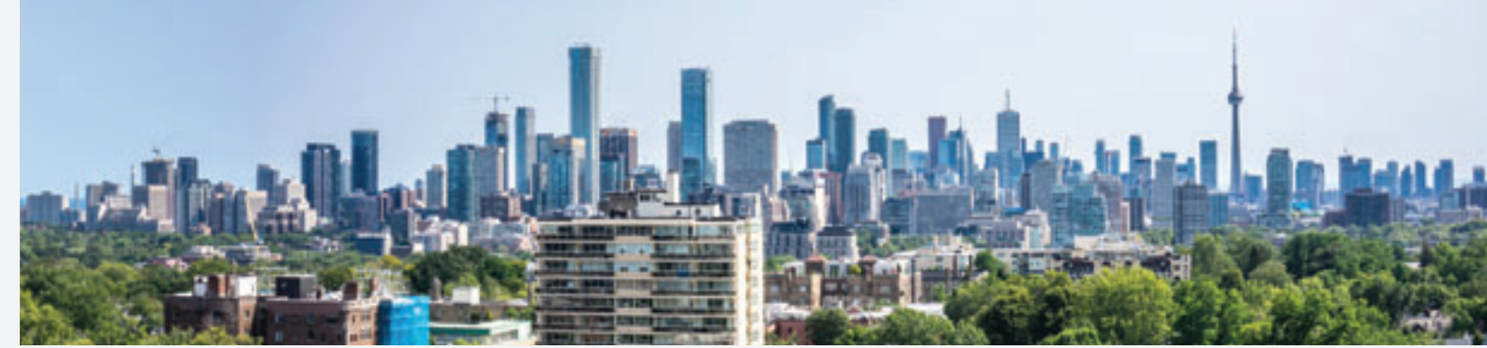
11th floor view facing south

3,418 sf Total – 2,881 sf Interior / 537 sf Exterior